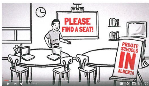
Alberta's Private Schools serve the Public Good

https://www.youtube.com/watch?v=VRusRMLmnZk&feature=youtu.be